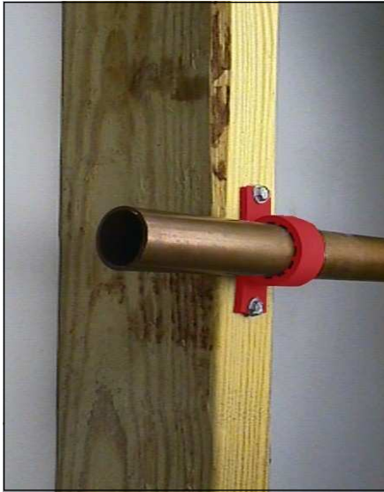
Use in pipe chase or on side of stud.