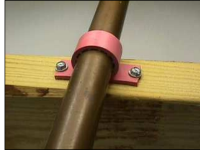
Use on above or below joists and rafters.

Pipe Clamps may be used in many applications to stand pipe away from wood framing, walls or surfaces. For use with copper or polypipe tubing and electrical conduit.